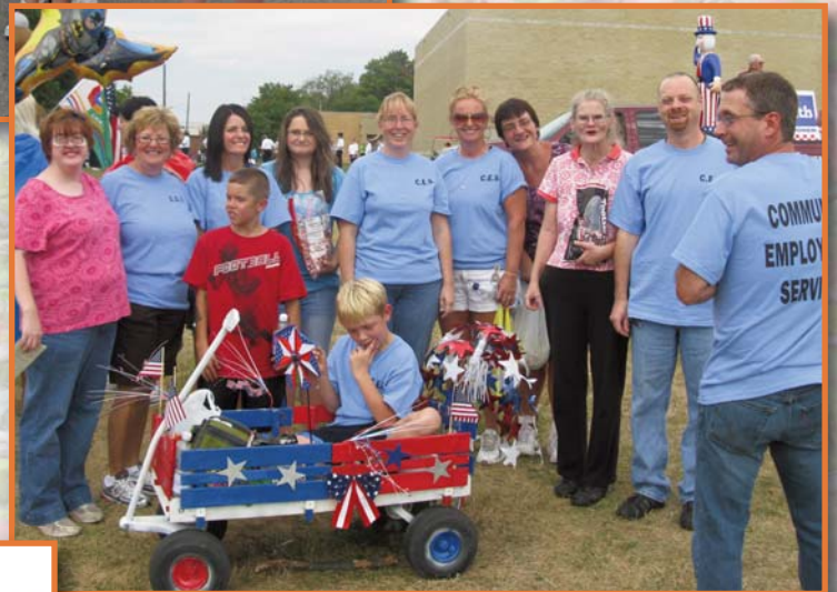
ABOVE: The enthusiastic CES crew gears up for the start of the parade.