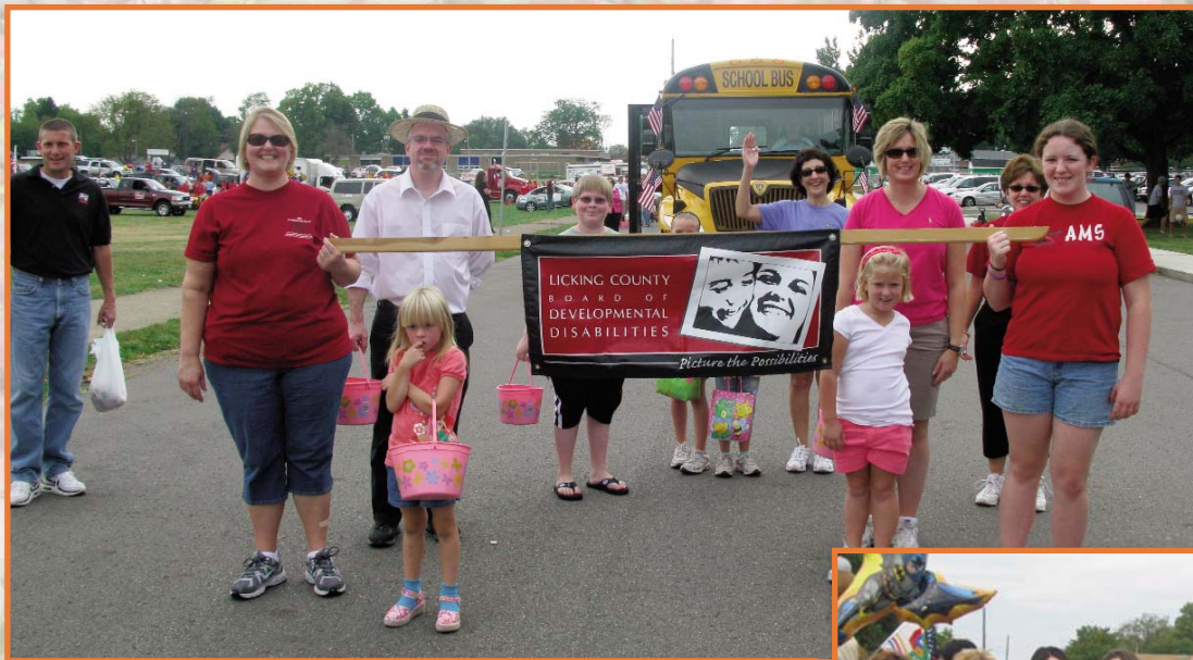
LEFT: LCBDD staff and family members participated in this year's United Way Parade, sponsored by the Newark Area Jaycees.