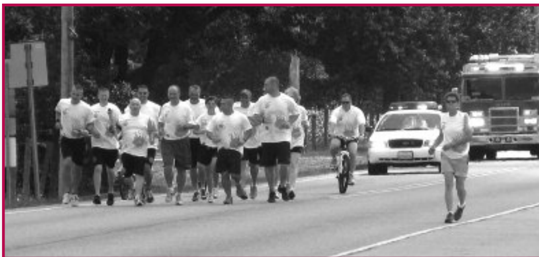
Left: Ohio Law Enforcement officials make their way west on U.S. 40 to the Hebron Kroger as part of the annual "Torch Run" leading up to the Special Olympics of Ohio games.