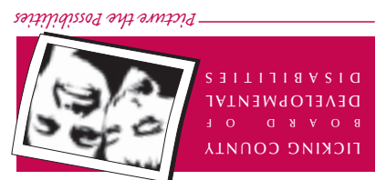
Picture the Possibilities

The Eleanor S. Weiant Center and Administration Offices 116 N. 22nd St. Newark, OH 43055