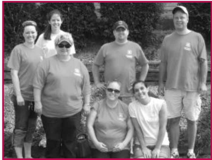
Far left: State Farm employees prepare to serve lunch to the 200-plus LICCO workforce on July 28.